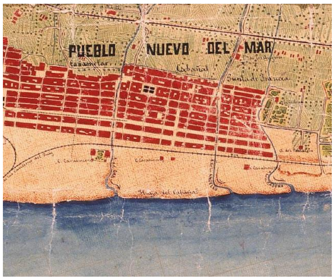
El Pueblo Nuevo del Mar en 1883. Aparece dividido en los tres barrios tradicionales de Cabañal, Cañamelar y Punta de Francia.