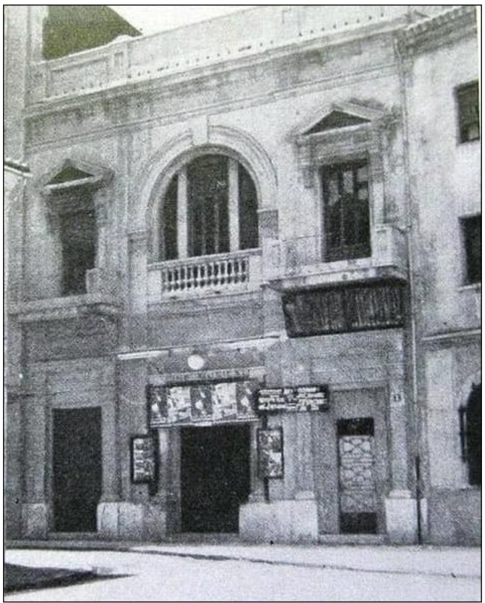
Facade of the Theatre when it was a movie theatre.